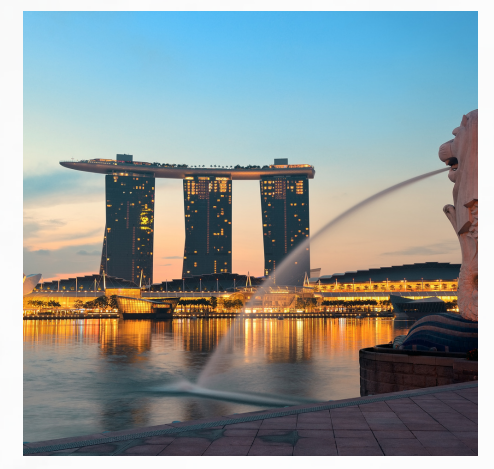
LOCAL KNOWLEDGE, GLOBAL REACH